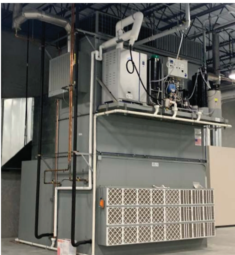
Johnson Air-Rotation units combat air stratification

With ceilings from 18' to 74', the expansive factory had an evolving floor-to-ceiling layout and an extensive conveyor storage system. The challenge for engineers, especially within the conveyor storage area, was to keep temperatures and humidity within a specific range from floor to ceiling with low air velocity. Strategic piping and placement of highly efficient air rotation systems would be necessary, as would staying within budget and ease of long-term maintenance.